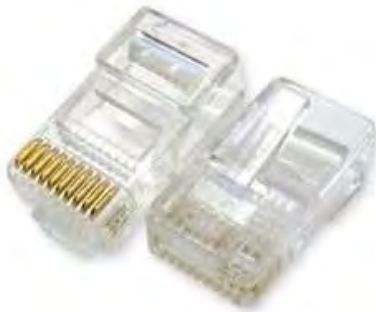
Figure 1 8-pin modular plug

The 8-pin modular connector (figure 1), often called a T1 or Ethernet connector, is used in many ways within the ham shack. What type connector it is dependent upon which pins are used and what signals are on the pins.