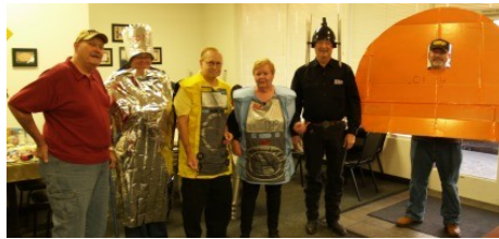
Same line up as above.