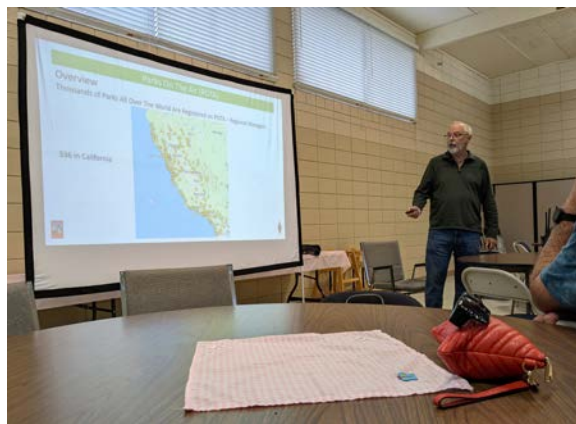
POTA map showing locations of sites in CA.